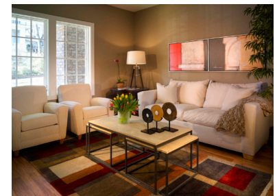
Windows are of generous size but very energy efficient.