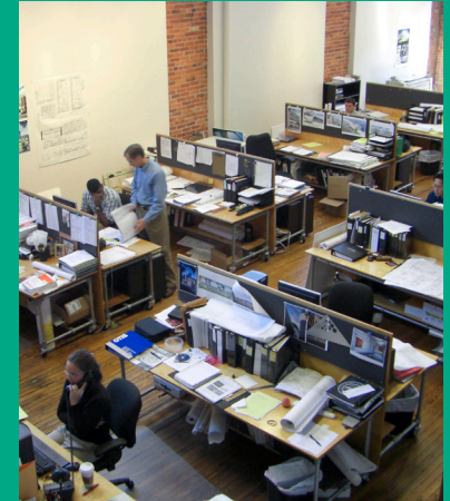
Herrington Architects occupies a single-level loft space just south of the historic Railroad Reservation in Birmingham.